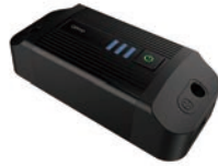
Smart Light (Switch) Control Box