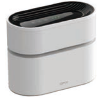
Smart Air Purifier