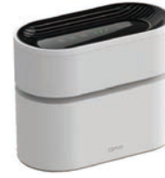
Smart Air Purifier