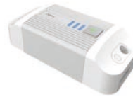
Smart Light (0-10V) Dimmer Switch Control Box