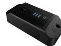
Smart Light (Switch) Control Box