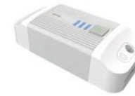
Smart Light (0-10V) Dimmer Switch Control Box