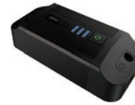
Smart Light (Switch) Control Box