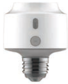
Smart Lightbulb Socket